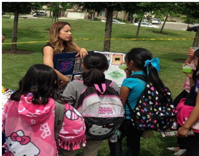
STOPP volunteer conducting education and outreach at the Second Annual Unity Fair, Cesar Chavez High School

Our third priority (Objective 3) involved developing coalition partnerships. STOPP staff was tasked with recruiting and maintaining a minimum of five new strategic community partners in order to support and strengthen tobacco-related policy, systems, and environmental change activities in San Joaquin County. Over the past year, the Coalition welcomed partners from the American Cancer Society, the San Joaquin County Asthma and COPD Coalition, Sutter Tracy Community Hospital, Health Plan of San Joaquin, and the U.S. Department of Health and Human Service's Office of the Assistant Secretary for Health/Office of the Regional Administrator.